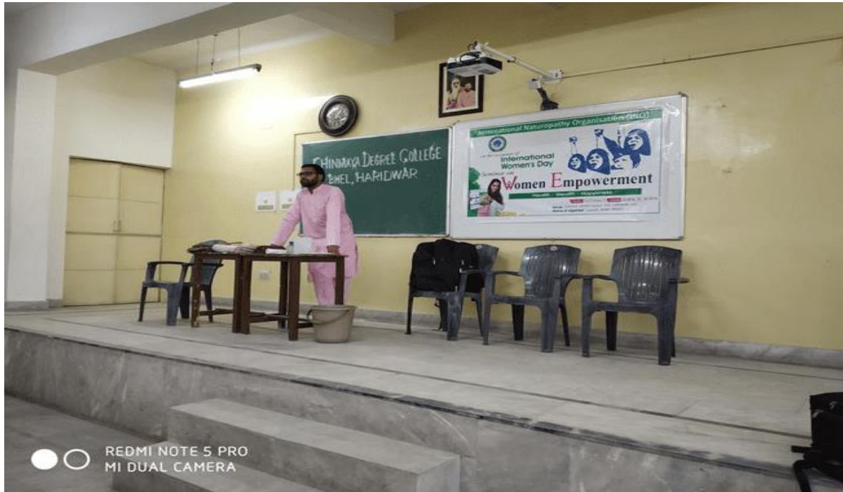
REDMI NOTE 5 PRO MI DUAL CAMERA